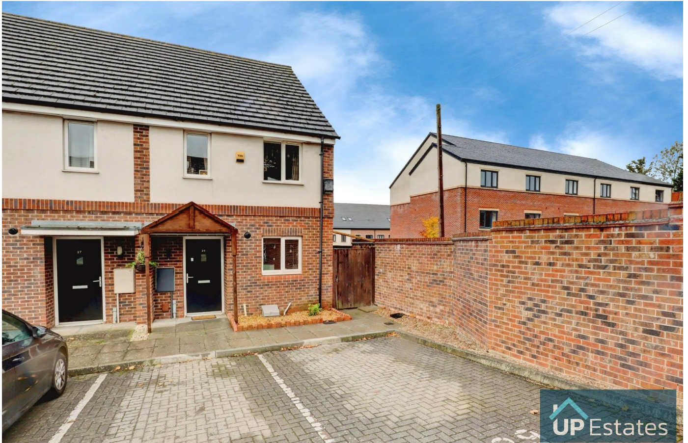
Willowbank Road, Hinckley